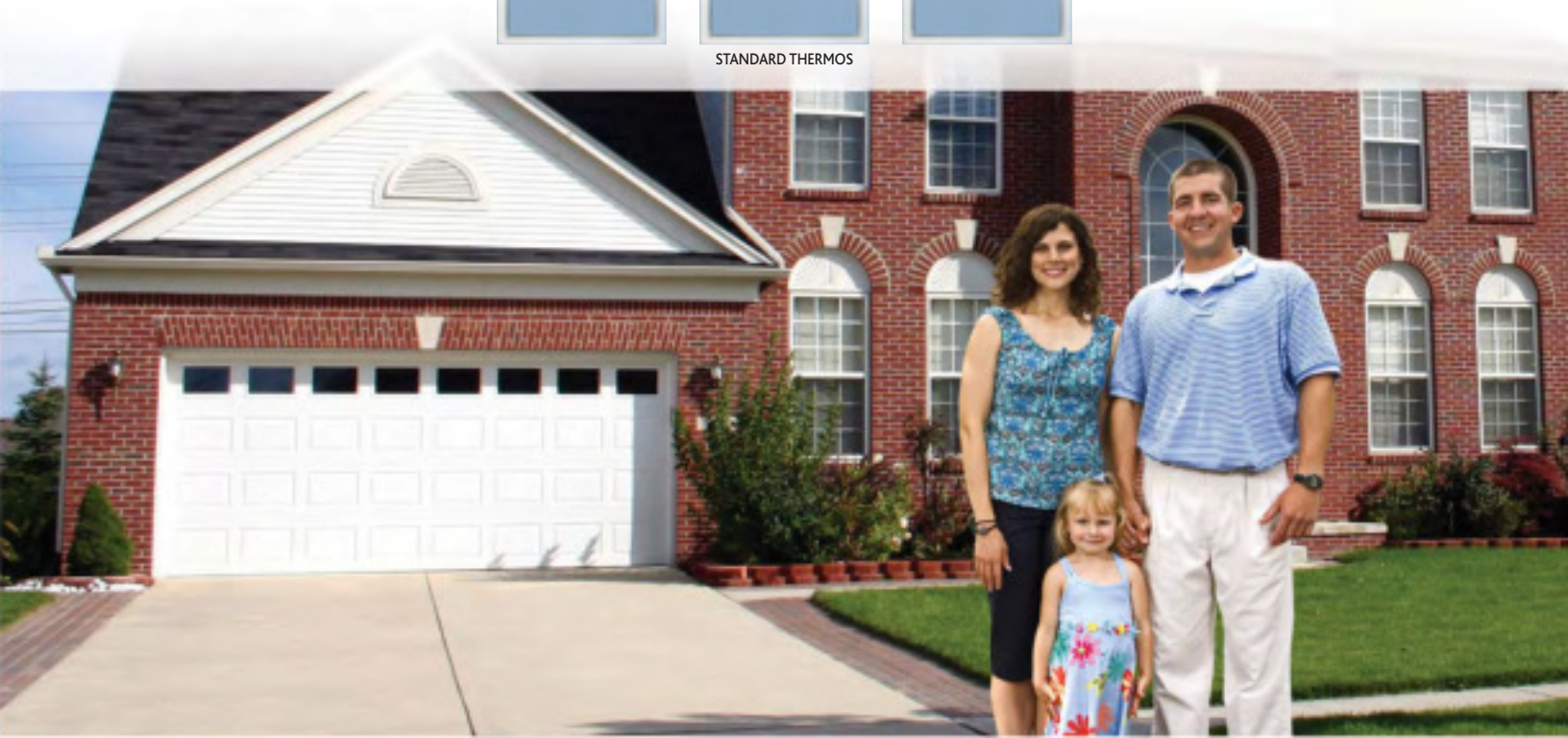
Model shown: ENCORE 4800 with standard glass top section.