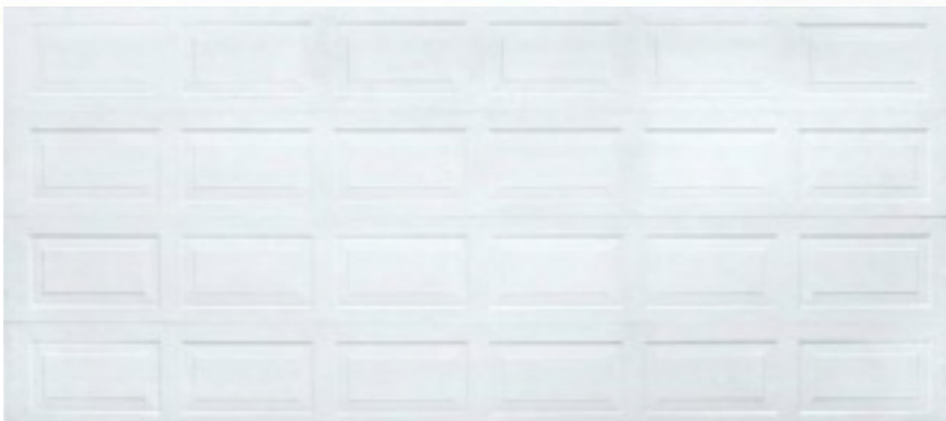
MODEL 3600 RAISED PANEL - 16 FT. WIDE

Deep, rich wood-grain finish provides a perfect combination of strength and durability.