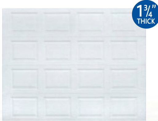
MODEL 4800 SHORT RAISED PANEL