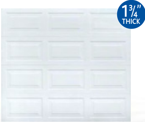
MODEL 3600 MEDIUM RAISED PANEL

Select from either a medium raised panel, a short raised panel, or a classic flush ribbed design.