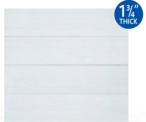
FLUSH WOODGRAIN RIBBED TEXTURE